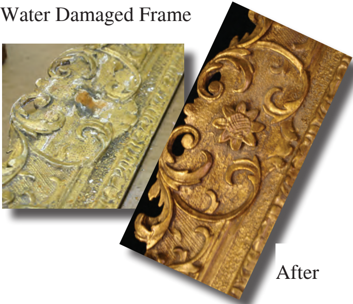
Before Water Damaged Frame