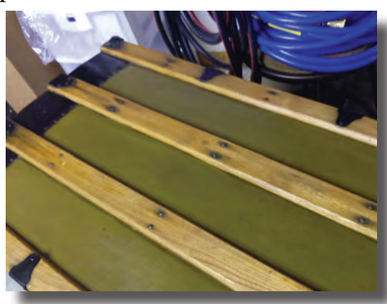
Before additional coats of Oak Staining on trim

Art Restoration, Repair and Conservation Services